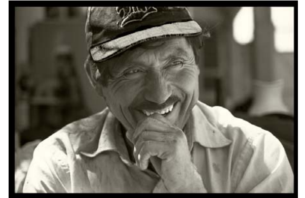
Man with Cap by John Wall, 1 st Place, 2008

A photographic exhibition of peoples & places of the world's dry lands.